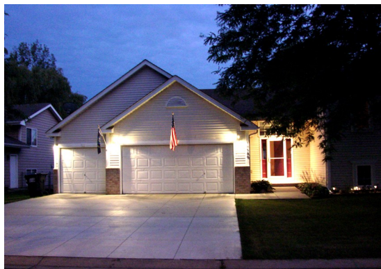
My yard sign. Guess who I will vote for.

Given the viscousness of the Trump Derangement Syndrome, this seems to be the only safe way to display a political sign. If you're brave enough to use a Trump bumper sticker, you can be sure your car will come out of this silly season with dents and scratches. What is with these people? Are their political ideas so tenuous that they have to use threats and violence to protect them from any type of disagreement? My choice of drink recipes for the duration of the campaign may have been in haste. These people are NOT going to be happy drunks. It may bring out even worse from their insecurity. Nancy Pelosi is sure proving that during her recent press conferences where she had obviously been imbibing. No wonder poor ole Joe Biden is hiding. Any old school politician who has survived 47 years in the arena must be totally confused with what's been happening. I'm sure Joe is. I know I am.