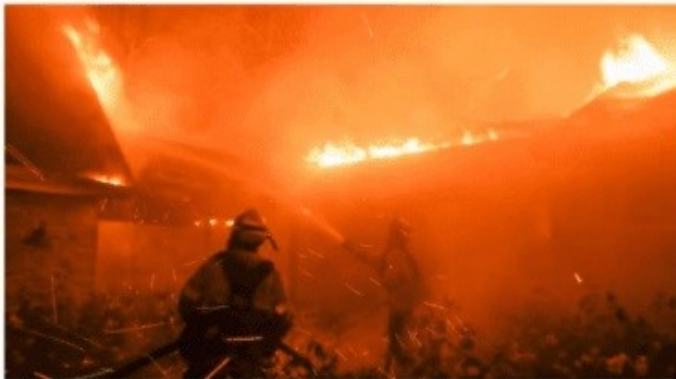
Firefighters battle the Steeple fire in Malibu, Calif., on Friday.