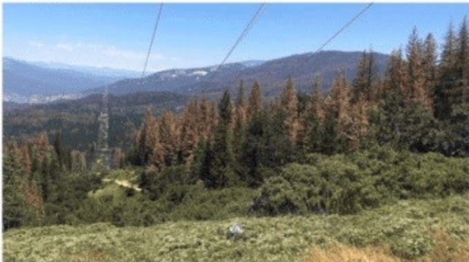
Patch of dead and dying trees near Cressman, Calif.