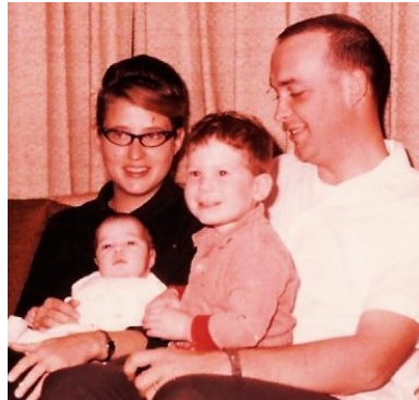
June 6, 1966 Started family and career: 3M Public Relations Department. What could go wrong?