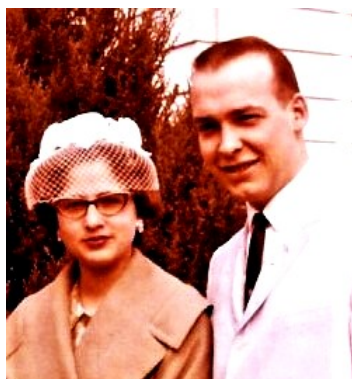
July 4th, 1962 Reported for duty at NAS Pensacola, FL just out of college.