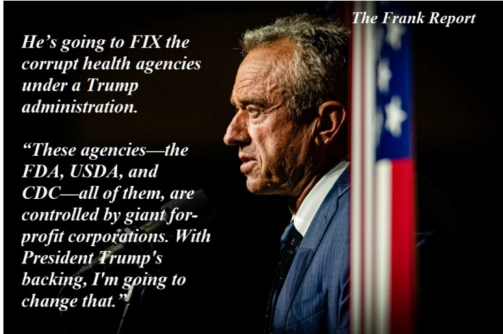
The Frank Report

He's going to FIX the corrupt health agencies under a Trump administration.