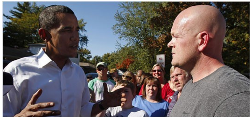
Remember Joe The Plumber's confrontation with Obama? He's just finished the bathroom in Obama's new mansion...