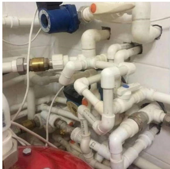
...just wait until Obama tries out the new bidet!

That's a wrap for this week. If you enjoy...pass it on. If you don't, I don't care...I'm old.