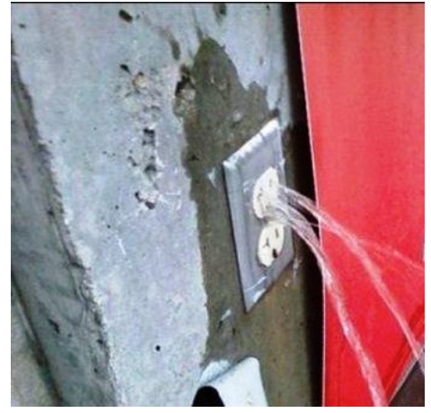
Bernie Sanders wants to consolidate and get government control over all utilities...what could possibly go wrong?