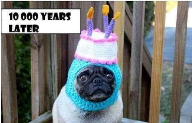
Try that with a cat...?