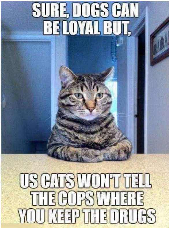
Maybe dogs snitch on drugs because...