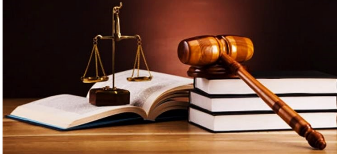
Lawyer Growth: 1900 - 2022

THE LAWS THAT WE ARE SUPPOSED TO BE AWARE OF AND ABIDE BY ARE SO COMPLEX THAT THERE IS AN ENTIRE PROFESSION DEDICATED TO UNDERSTANDING THEM