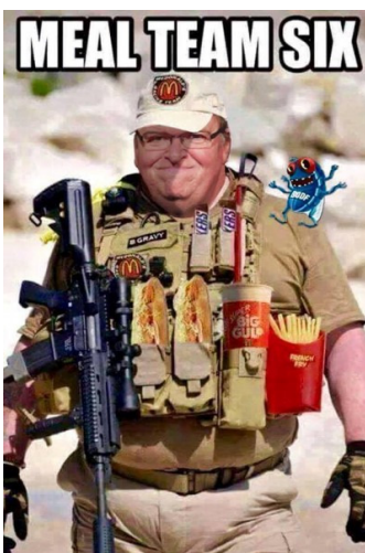
Somebody say food?

Tip: to speed up ripening of avocados, place in paper bag. To slow it down, put them in refrigerator.