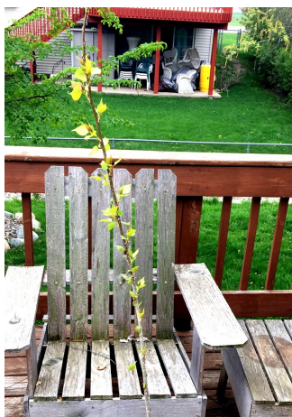
MN winter? Pffffft!

I put the pot back on the deck with one of the assumed dead branches still in it. Over the next winter, it hit 27 degrees below zero several days and it is now May 5th.