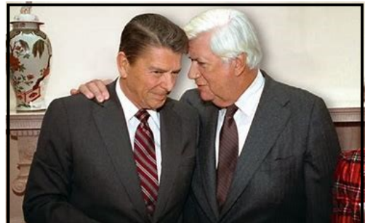
"Joe Biden says he's gonna run for president."

(Just in case some liberal reads this... yes, I'm kidding.)