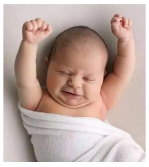
Congratulations! You made it past the Democrats and Planned Parenthood!

However, when you realize that the abortion industry revenue is approaching $2 BILLION annually (and that's just Planned Parenthood) maybe Joe is after his 10 per cent?