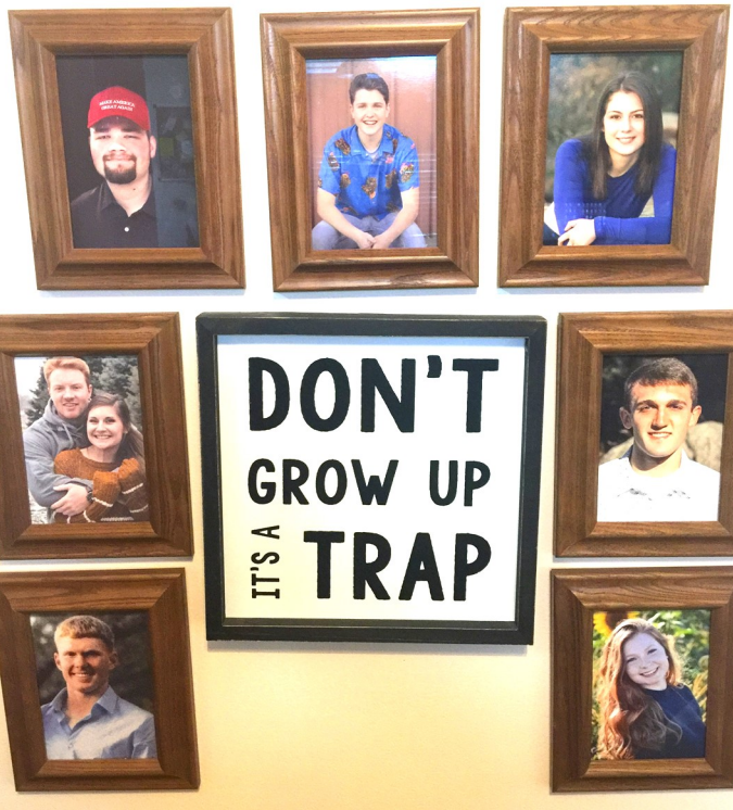
Can you find the four? They obviously did not heed my advice