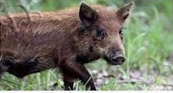
Pig in Australia Steals 18 Beers from Campers, Gets Drunk, Fights Cow gadling.com

I know the official mascot of the Marine Corps is the bulldog but hear me out..