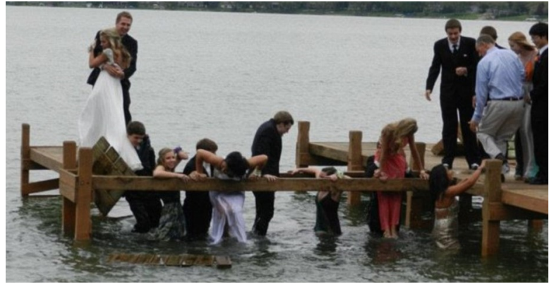
The reports I got from grandkids about their prom experience was much gooder than this group's attempted photo in Wisconsin.