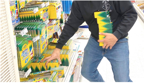
Remember those people who bought all the toilet paper? Caught one getting ready for self quarantine.