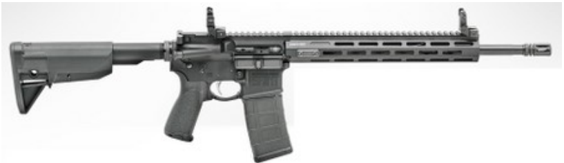
Springfield Armory Saint AR15 costs $952.99 The government is sending me a check for $1,000.00 Coincidence?

We now return you to regularly scheduled broadcasts featuring the shortage of toilet paper because President Trump.