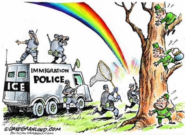
With the bars closed on St. Patrick's Day, there's a terrifying consequence: sober Irishmen. God gave the Irish some amazing traits but invented whiskey to keep them from taking over the world.