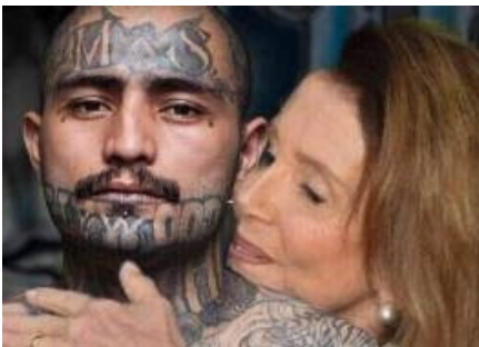
Pelosi loves them new Democrat voters. Your caption?

Brown ground beef and onion in skillet. Mix all the cheese together. Add garlic powder, tomato sauce, tomato paste, salt and oregano. Cook long enough to get it warm. Spoon a layer of meat sauce onto the bottom of the crockpot. Add a double layer of uncooked lasagna noodles (break to fit) and top with cheeses. Repeat with sauce, noodles and cheeses until all are used up. Cover and cook on low for 6-8 hours. Good with chianti.