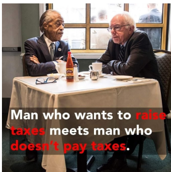
Man who wants to raise taxes meets man who doesn't pay taxes.

May explain how Schiff for brains got elected...and why voting rights are being pushed by Democrats for illegals? Also wonder if Epstein will be voting for Jerry Nadler?