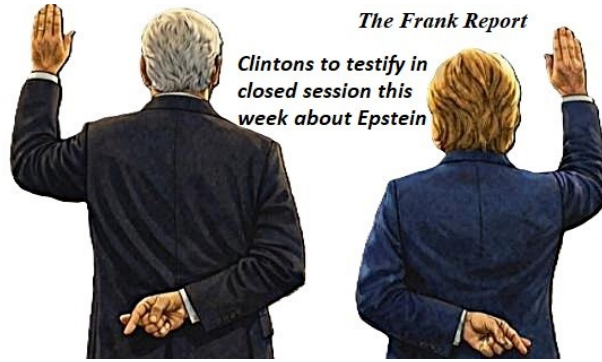
The Frank Report

"All tariffs imposed under those authorities remain fully in effect and all trade agreements and commitments secured during this period remain in place. The Court's ruling does not unwind negotiated deals, investment pledges, LNG purchase agreements, or manufacturing commitments." Clarence Thomas dissent explained. "There is a hard line between domestic power and foreign trade authority. Congress holds the taxing power and the power to set domestic rules governing life, liberty, and property. Foreign trade regulation isn't a core legislative function, and delegating it to the executive doesn't violate separation of powers at all. In fact, it's actually consistent with how the Founders understood the relationship between the two branches". SCOTUS Actually Reaffirmed Trump's Tariff Powers and why they ruled against the wrong authority he used.