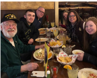
Mexican restaurant welcomed us.

It's a complicated recipe but I'll send it to anybody as a separate email attachment. Roselee once said I should open a restaurant; I countered with the question of who would pay over $40 for a pizza? Gracie has added shortcake to the menu when we have pizza.