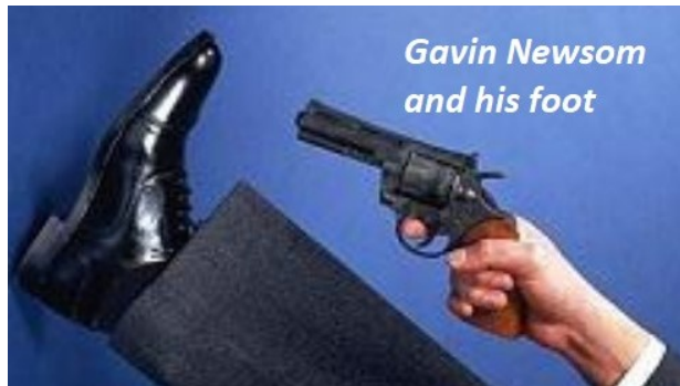
Gavin Newsom and his foot

My favorite Newscum story: Newsom got elected Governor and said, "The idea that it's 2019, and we are using analog systems for our 911 system designed decades ago is astounding, and we need to make investments to make sure the technology aligns with the devices people are using in their daily lives." Since then, Newsom spent $450 million to build a new 911 system, but when it came time to turn it on, it did not work. California still relies on analog systems. Anybody wonder where that $450 million went?