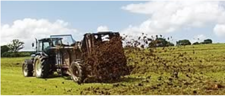
Most of our readers will recognize this as a manure spreader.