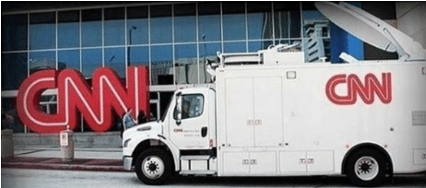
Here's the digital version.