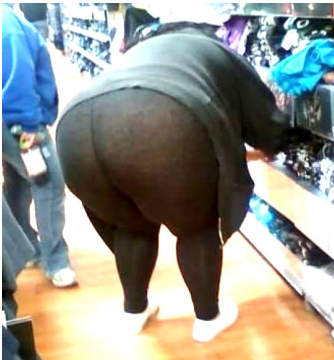
Eye bleach is in aisle 15.

Bidenflation has arrived at Walmart where they are now “protecting” $20 ribeye steaks with wire mesh on the packaging. Harder to hide in your yoga pants?