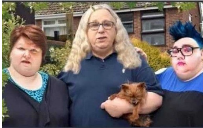
THIS is Dr Rachel Levine...our overweight, transgender health secretary in charge of America's healthy lifestyle...shown with his/her/its family...

All the news I see fit to print. Freedom of the press belongs to those who own one.