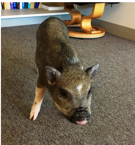
Kevin is at the local animal compound waiting for his owner to claim him.