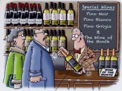
You'll like this one! It's made from an anti-diuretic hybrid grape and reduces the number of trips people your age go to the toilet during the night. It's called PINO MORE!

Tip: the seeds into a paper bag with the microwave works. Don't include the cob...I damn near set the house on fire!