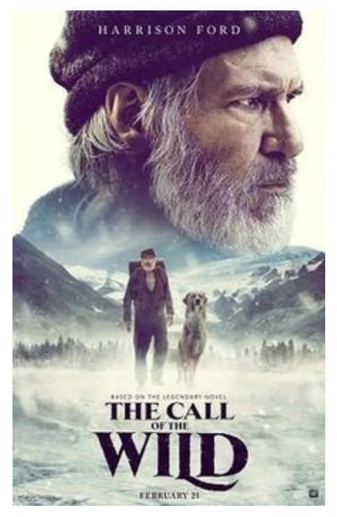
February 21st is the release date of the re-re-re-remake of this book by Jack London. Word is Harrison Ford wakes up in the woods after eating potent mushrooms and starts calling his dog Chewbacca.

The mayor of Kansas City says if the 49ers win he will send the San Francisco mayor a rack of ribs. And the San Francisco mayor says if KC wins he will take a dump on their sidewalk.