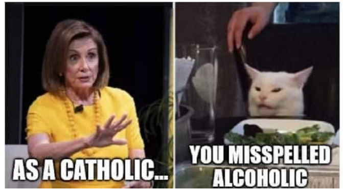
I enjoyed this meme but then, I'm a recovering Catholic.

Not quite a meme but note the absence of reporting on the social activities of the main witness against Trump during the "somber" hearings. At least she held up all her fingers while being sworn in...or at? BTW: tuition at Stanford Law School is over $60,000.00 a year. Just about Hunter Biden's hourly salary in the Ukraine. And less than the bribe some limousine liberals paid to get their kids into the school so they could become (D) congressional staff lawyers.