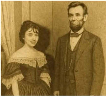
Nancy Pelosi being sworn in for her first term?