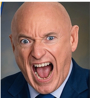
This one told the troops to ignore the CinC. He might want to consider hiding on the space station?