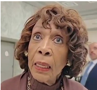
This one called Trump a killer. Did he kill that thing on her head?