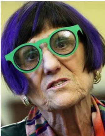
If you don't believe in election fraud, please explain where "this" came from.