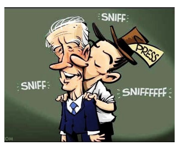
CNN has redefined shoplifting as shopping without money and now plagiarism as sloppy attribution.

The Associated Press, not only claimed conservatives were responsible for Harvard's Claudine Gay's resignation after she was found to have plagiarized her academic work almost 50 times, but it also claimed that "white colonists" practiced scalping on Native Americans