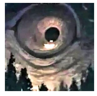
Waiting for an answer...

Before you gather those ballots and deliver them to the polling station, be aware that all tires now have a GPS chip installed. Look for that tiny antenna and snip it off to avoid being tracked.