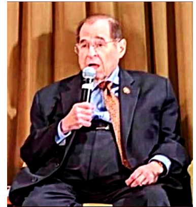
Jerry Nadler has been making a fashion statement for years...

Trump has ordered a communications blackout at America's federal health agencies. The CDC, FDA, HHS and NIH have all been told to pause external communications: publishing scientific reports, updating websites or issuing health advisories.