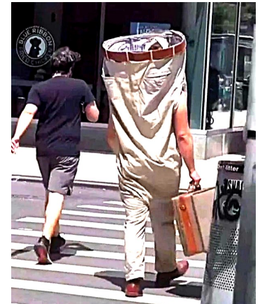
...looks like it's catching on. NY is new fashion capital?