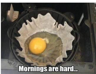
Mornings are hard...